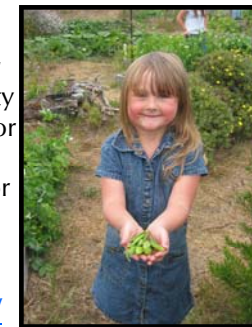
Gardeners harvesting peas at the Manila Teenship Wellness Village Garden.

To read the Community Food Assessment of Humboldt County, visit CCRP's website at www.humboldt.edu/ccrp/blog/humboldt-county-community-food-assessment .