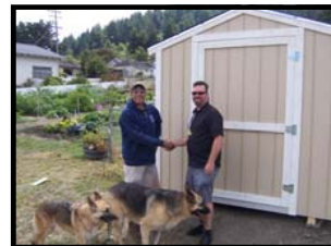
Capital City Sheds donates a shed to the Rio Dell Community Garden.