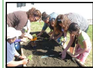
Gardeners of all ages planted lettuces, radishes, and flowers at El Jardin de Las Familias de Loleta last fall.